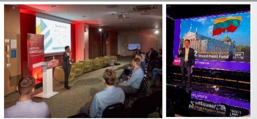
Davos Forum and Startup Fairs