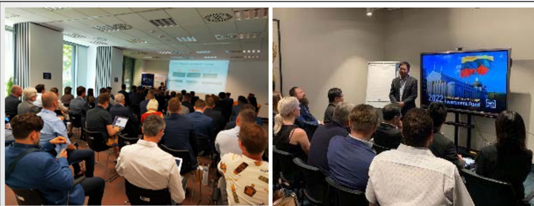
Briefing CEE fund in CEE countries